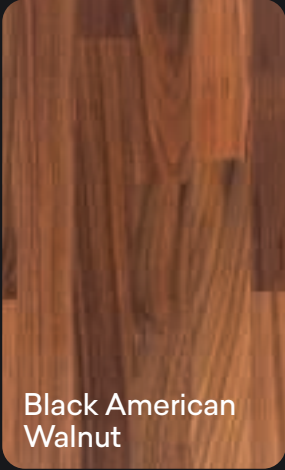
Black American Walnut