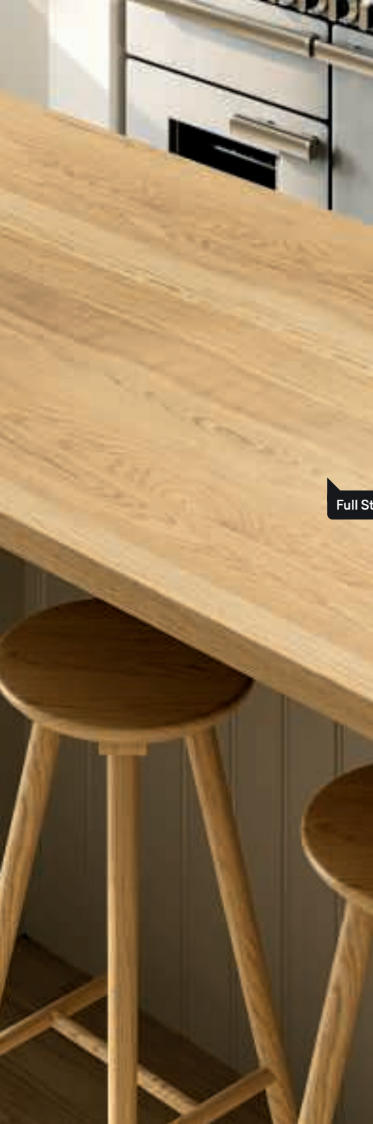
Full Stave Oak