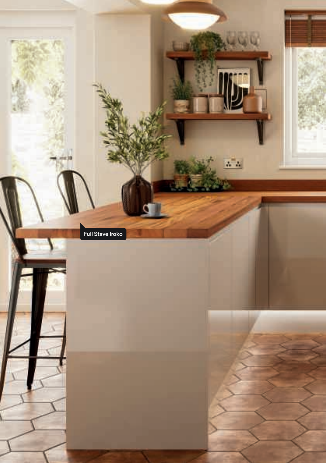
Full Stave Iroko