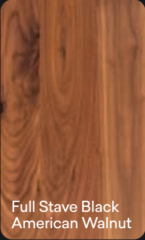
Full Stave Black American Walnut