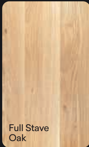
Full Stave Oak